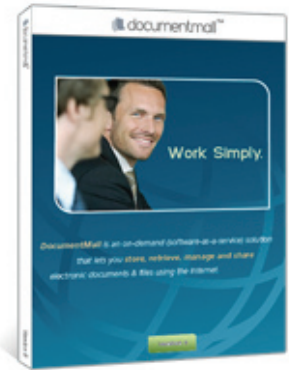
Your DocumentMall on-line storage account includes the DocumentMall Resource CD

DocumentMall is Developed on the EMC Documentum Enterprise Content Management platform. DocumentMall leverages Documentum's robust Documentum management features including library services, document types, sophisticated search capabilities and administrative functions and takes advantage of the strong security mechanisms to ensure the highest level of document security.